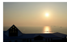
Figure 9. The use of the word TENGOKU in an article titled iine! tanbouki kanashimi wo tsuzumikomu, kami no kihai ENDO Shusaku Bungakukan Nagasaki-shi