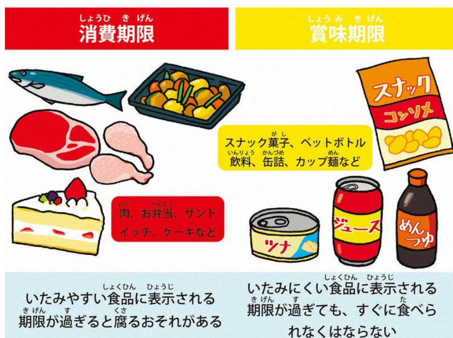
Figure 7. Examples of Product Differences Using SHOUMIKIGEN and SHOUHIKIGEN

The explanation in Figure 6 shows that shouhikigen recommends that the food or beverage product be consumed before the time stated has expired. Meanwhile, even though the time limit stated according to shoumikigen has passed, the food or beverage product is not necessarily unconsumable.