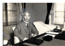
Figure 3. The use of the word MEKAKE in an article titled “Torako” Moderu No. bokousousetsu ini kouken yo no jousei wo hagemashita saibankan no handan

同邸を運営する住民団体がパネル12枚を使い、横田の人となりや、審理を担当した裁判が社会に与えた影響、初めて女性弁護士となった三淵ら3人の人生の歩みを伝えている。中でも、詳しく解説しているのは、横田が大審院の裁判長として、審理のやり直しを命じた、ある地裁判決とその後の経過についてだ。男性は浮気をしたり、妾（めかけ）を持ったりしても、法的に何の罪にも問われない一方、女性側には姦通（かんつう）罪が適用され、貞操を守る義務を負わされていた時代だった。